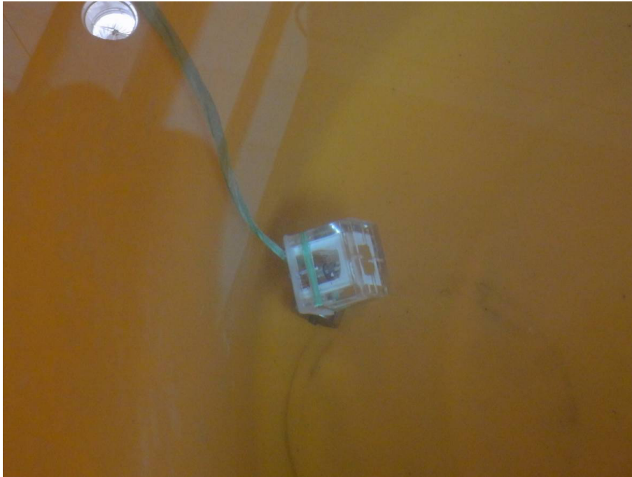
IPX7 after the test