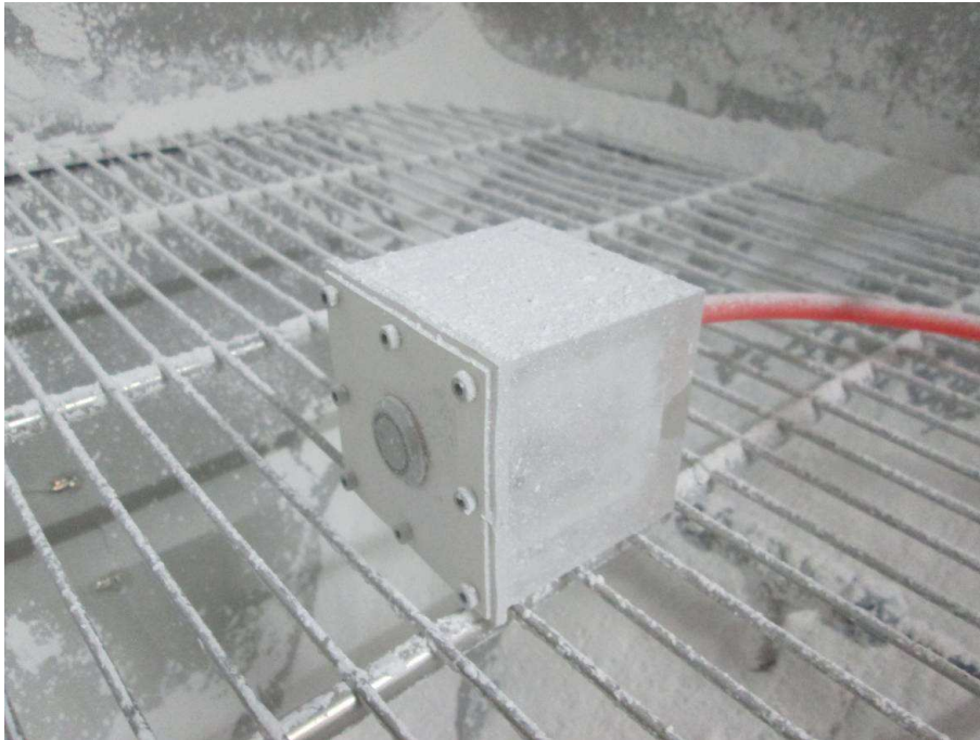
IP6X after the test