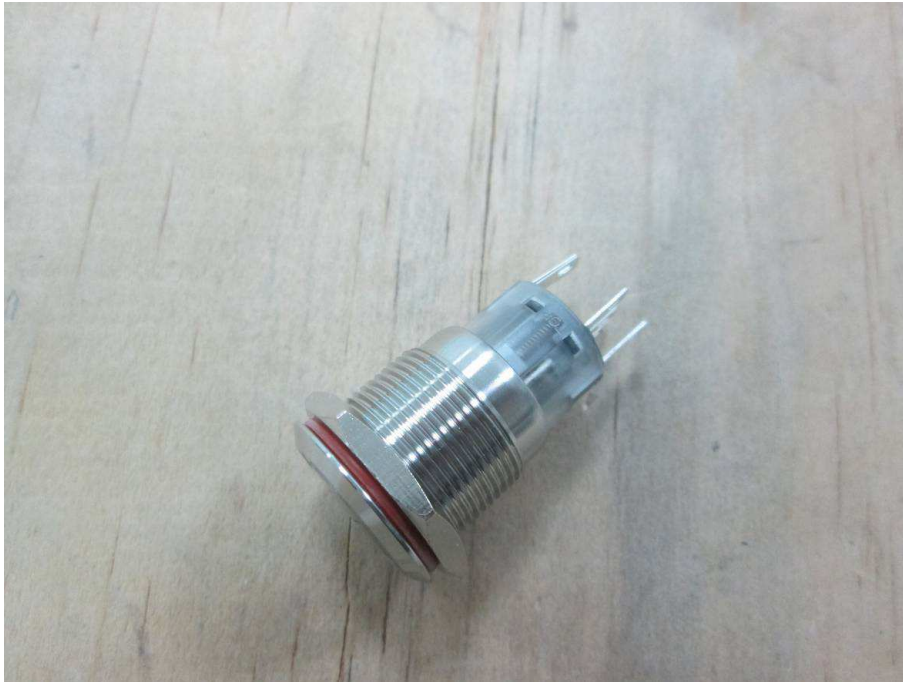
The appearance of photo