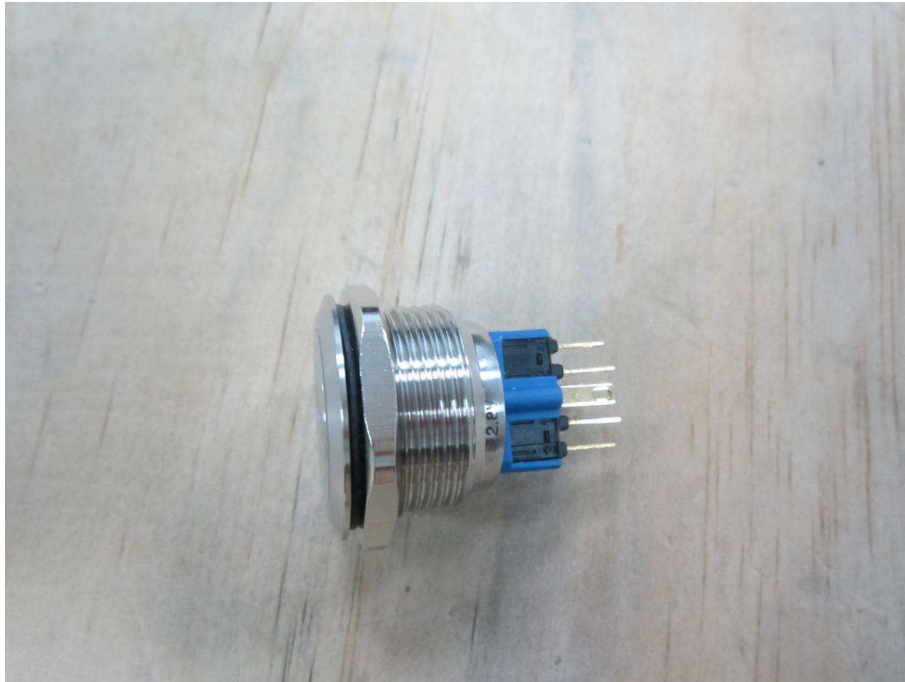
The appearance of photo