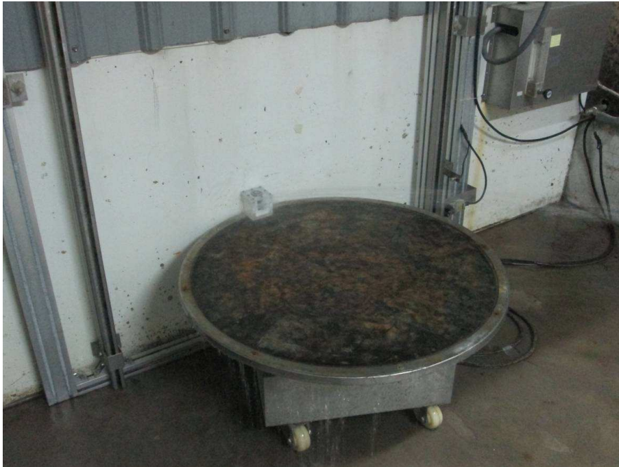
IPX5 after the test