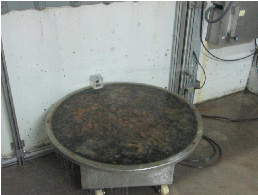
IPX5 after the test