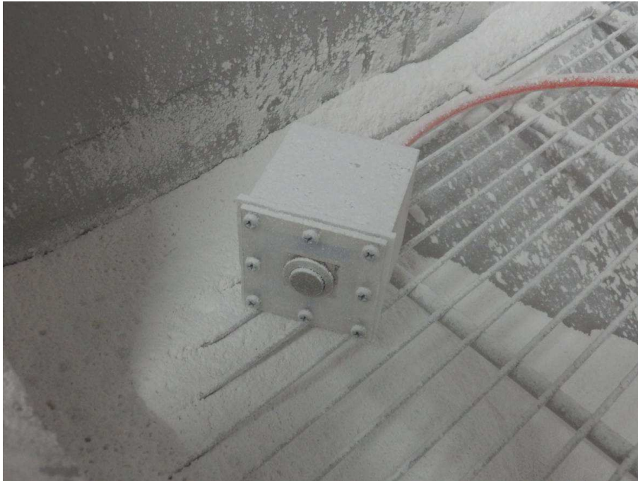
IP6X after the test